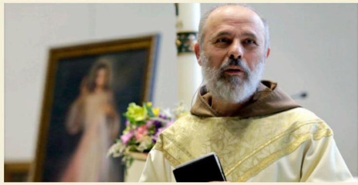
Saint Maria Goretti Church Thursday, October 24, 2024 at 6PM